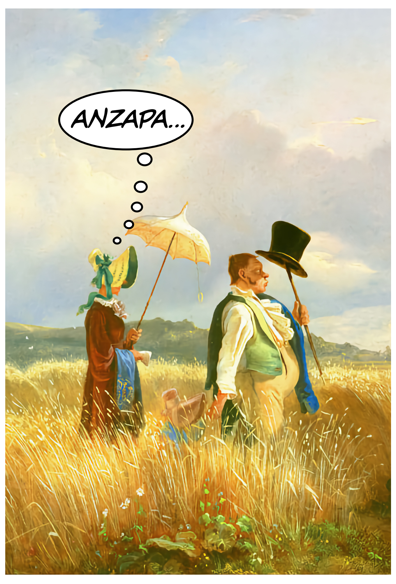
MAILING 330 - DECEMBER 2022